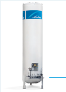
Linde cryogenic vessel